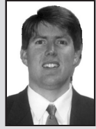
Bradley Development League

Last year Bradley International Airport, New England's second largest airport, had a record-breaking 7.4 million passengers surpassing the 7.3 million recorded in 2000. A study by the Connecticut Department of Economic and Community Development completed in 2005 found that over the next 20 years Bradley "will contribute, on average, more than $34 billion in output, nearly $11 billion in in-